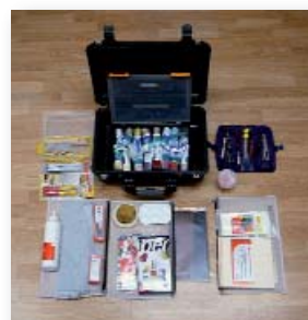
Camouflage & Concealment